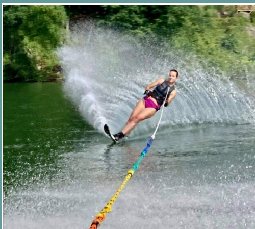
Who says 50 isn't fabulous!