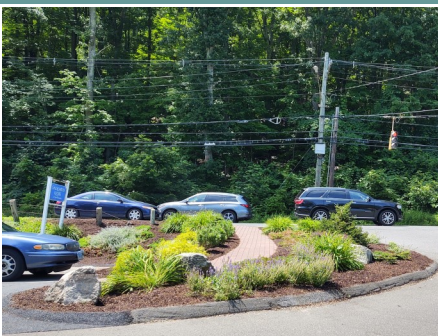
Front entryway ... done!