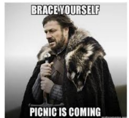
Be prepared for fun!