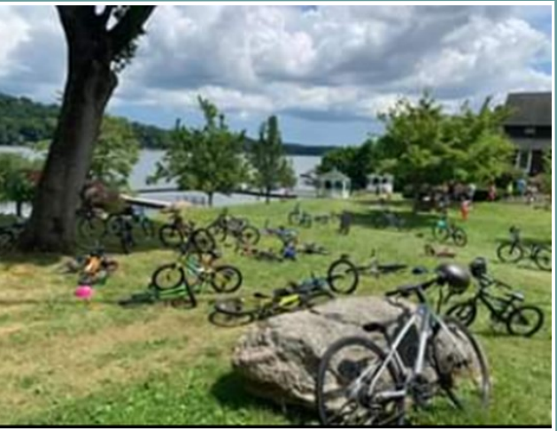
CKCP bicycles practicing Social Distancing!