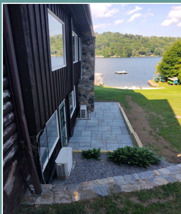
NEW CLUB PATIO!