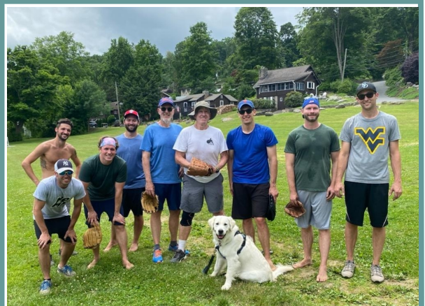
CK SANDLOT BOYS!