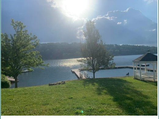
AN EARLY MORNING WALK The Knolls at peace!