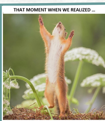
WE DODGED A BULLET!