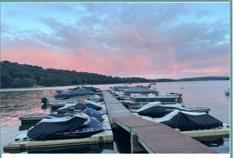
Batten down the hatches ... there's a storm a comin'