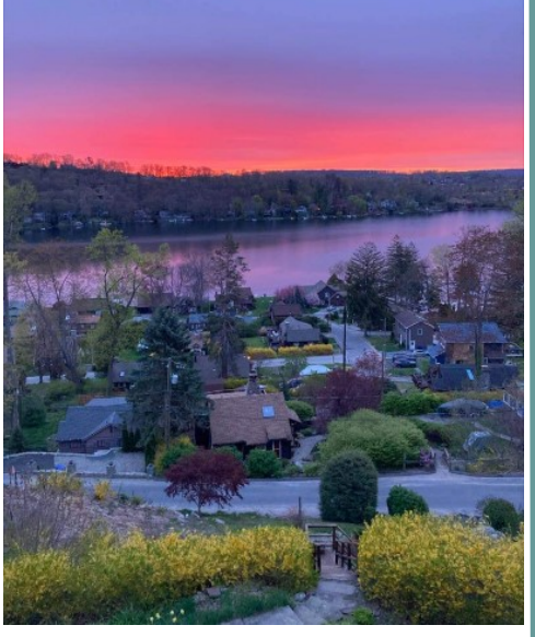
DAWN IN THE KNOLLS (From The Anderson's Deck)