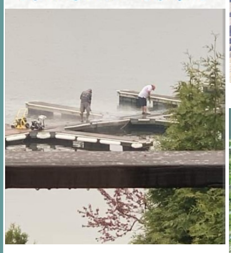
MEN AT WORK - POWERWASHING