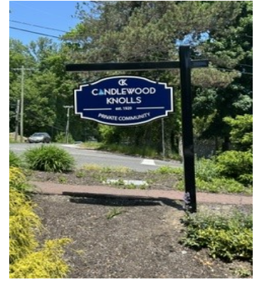
New CK entrance signs