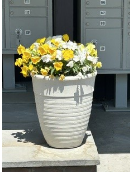
Spring flowers at our mailbox station—donated by the Gelcich Family