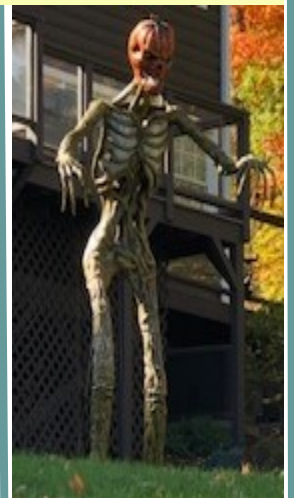
Check out this guy... 2 Summerhill Road He's photo friendly!