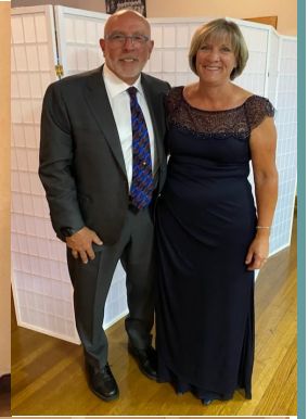
President's Dance September 3rd, 2022