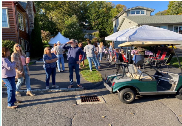
On Saturday, October 15 th , the neighbors on Knolls Road hosted a block party. The weather was the perfect setting for great company and delicious food. Perhaps other streets may want to give this a try in 2023.