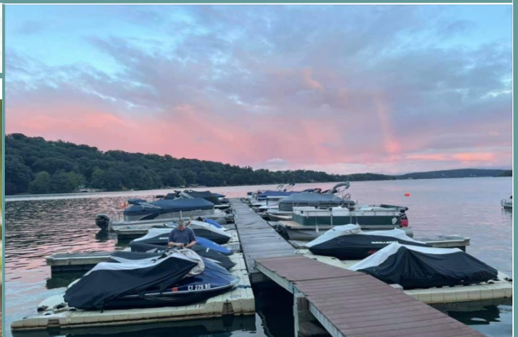
Batten down the hatches ... there's a storm a comin'