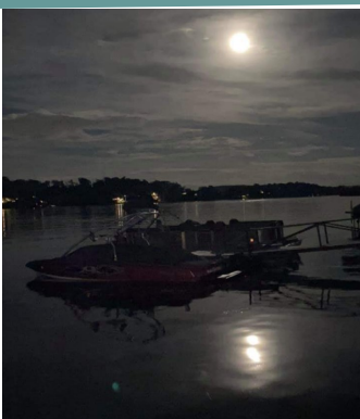
I see a bad moon rising!